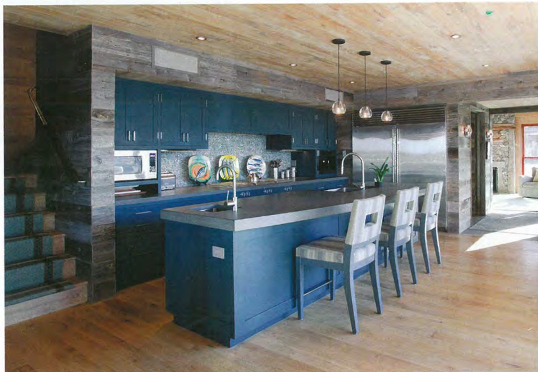
Custom yet classic. The bulk of the kitchen is nestled into a nook toward the north side of the house. Bluestone countertops sit on cabinets painted in Benjamin Moore Navy Masterpiece blue. Using colors reflected in the landscape helps ensure timeless interiors.