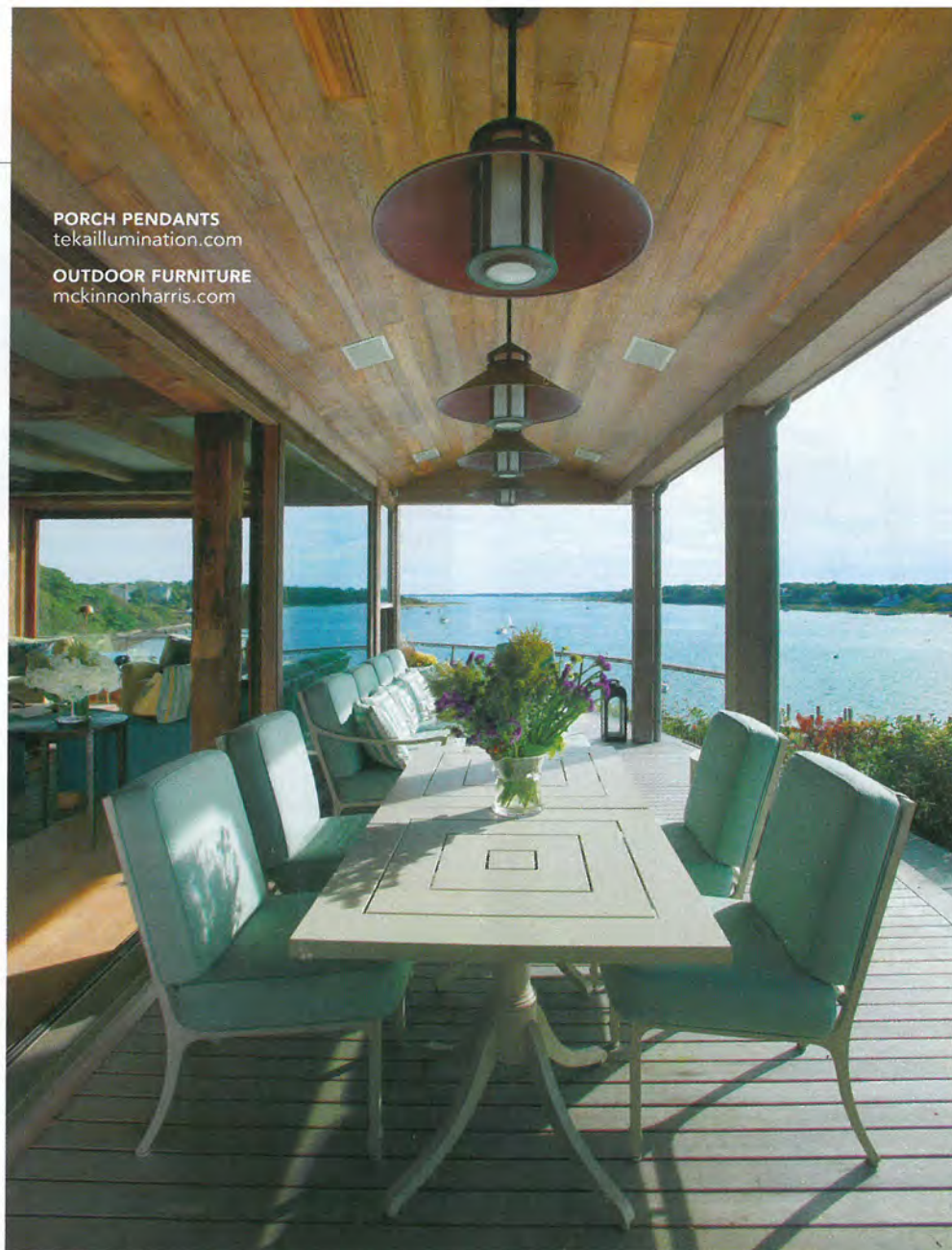
PORCH PENDANTS tekaillumination.com OUTDOOR FURNITURE mckinnonharris.com

The home's attitude toward outdoor living may be one of its more modern marvels. The combination of the deck to the south, the porch to the west, and a fireplace patio to the east roughly doubles the shared living space. Taking full advantage of a 270° water view, the deck's curved edge follows the nearby conservation land's boundary. In a stroke of design brilliance, the team mounted the guardrail at the bottom of a series of step