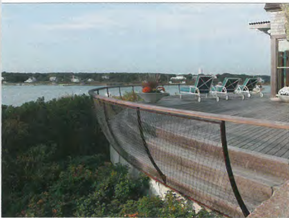
A deck detail to admire. The main outdoor living space, the deck, is designed to preserve the view of the harbor. Locating the railing at the bottom of a series of step seats lowers its overall height—while still meeting code—in order to provide people on the deck and inside with an unobstructed view to the south.

that it would stand the test of time aesthetically, they also wanted it to be responsive to the lifestyles, material innovation, and technology of our time. With a nod to contemporary living patterns, the floor plan features an open L-shaped shared living space. It also provides easy access to the outside. The interior colors—drawn from those of the sea, the shore, and the surrounding flora—help one space to flow into the next, creating a sense of spaciousness.